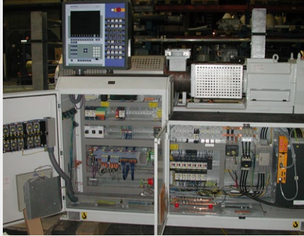
B&R series 2005 or 2003