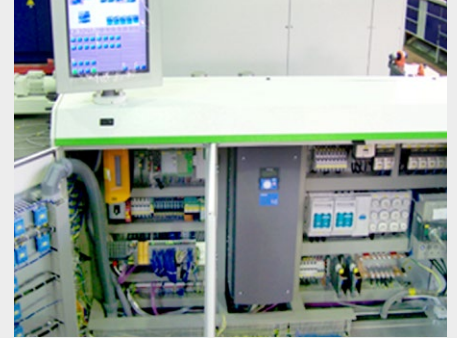
B&R series X20