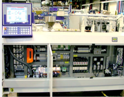
B&R series 2003