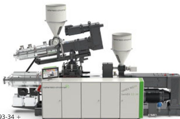
twinEX 93-34 + conEX NG 54 coex