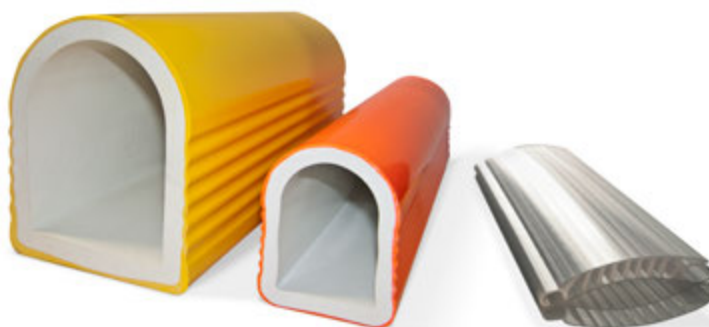
Co-extruded protective profile photo MPM®